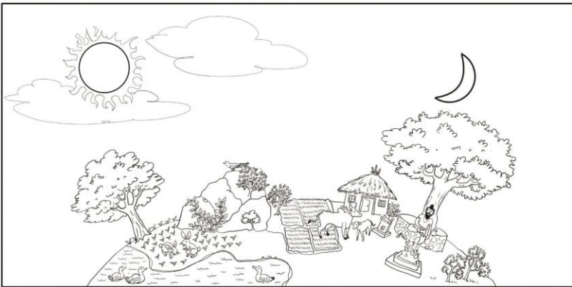
1. The Nature

Fill colours to the following graphic illustrations. Transliterate shlokas of this lesson on the other side of this page. Make an oral presentation of shlokas and a brief summary of their meaning either individually or in small groups.